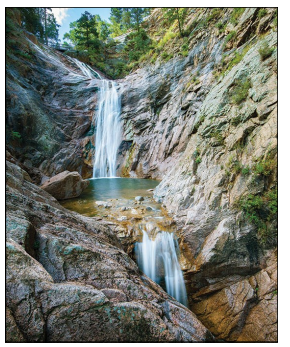
Broadmoor Seven Falls