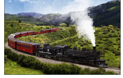
Cumbres & Toltec Scenic Railroad