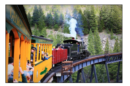
Georgetown Loop Railroad